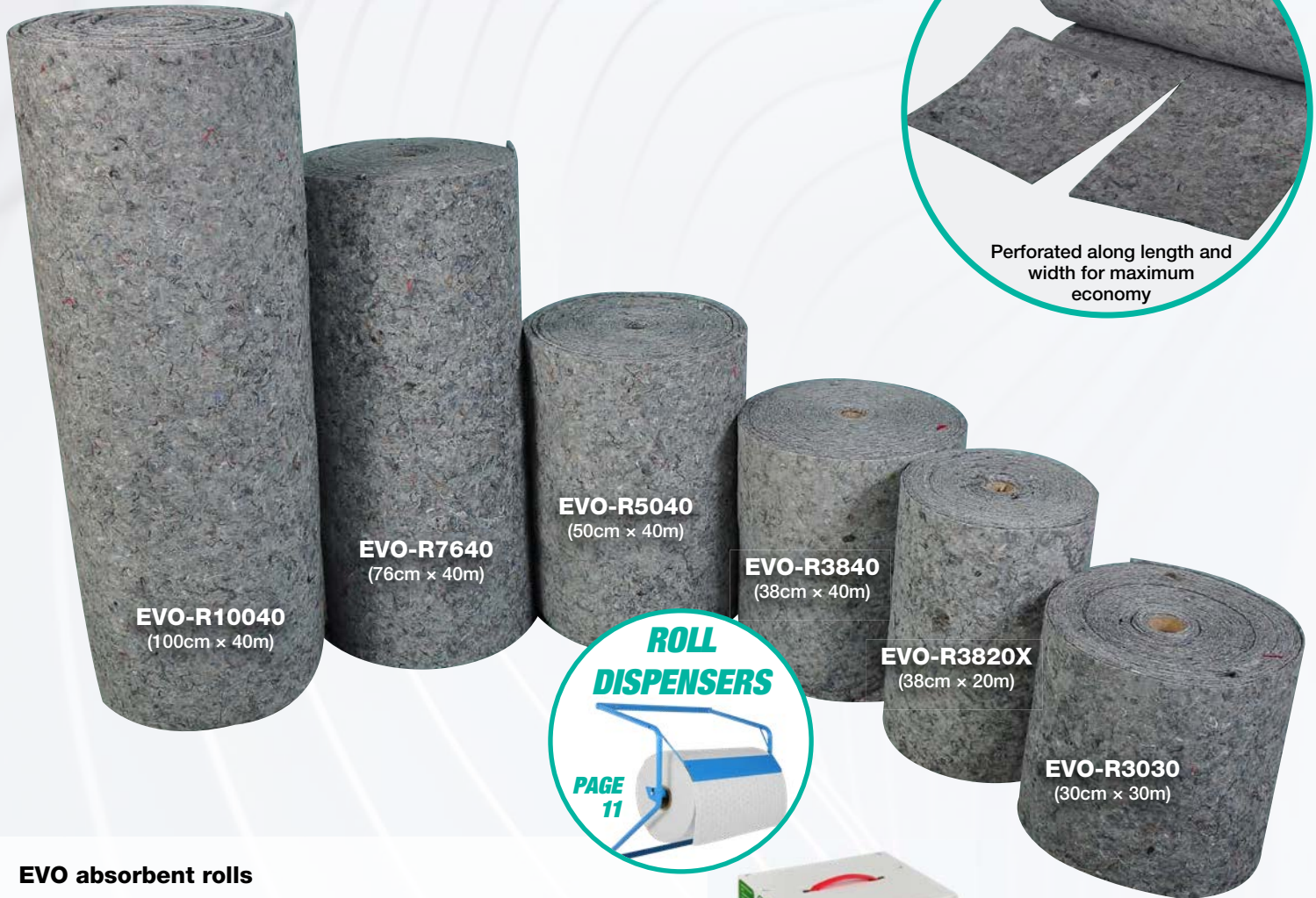
EVO-R10040 (100cm × 40m)